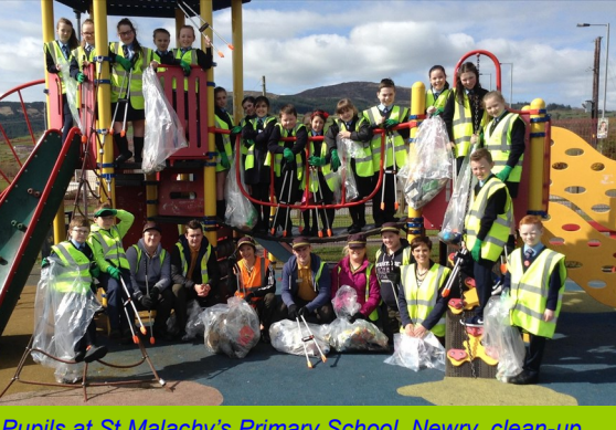
Pupils at St Malachy's Primary School, Newry, clean-up their local area with the Big Spring Clean.

you can pledge your support to the Live Here Love Here campaign and receive updates about actions being taken in your community.