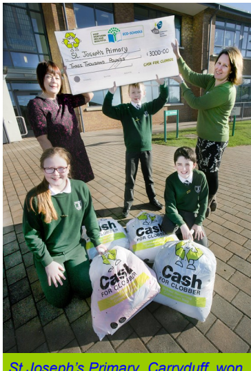
St Joseph's Primary, Carryduff, won the top prize of £3000 for their school with Cash for Clobber 2015.